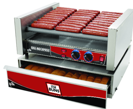
Models X30S Shown with XBW30

Star's Grill-Max ® Express ™ Roller Grills are covered by Star's one-year parts and labor warranty.