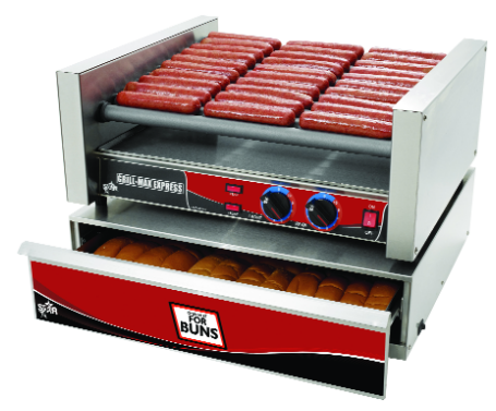
Models X30S Shown with XBW30

Star's Grill-Max<sup>®</sup> Express™ Roller Grills are covered by Star's oneyear parts and labor warranty.