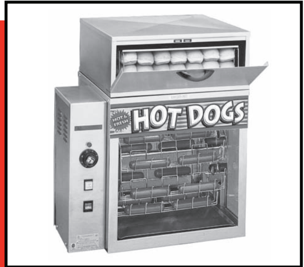
MODEL DR-2A HOT DOG BROILER WITH OPTIONAL BH 1A BUN HOLDER

* Please note: DR-1A and BH-1A are listed with UL, NSP and CSA as individual components only, not as the DR-2A package.