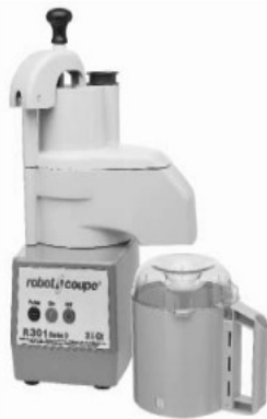
R301 Series D Model has Gray Bowl