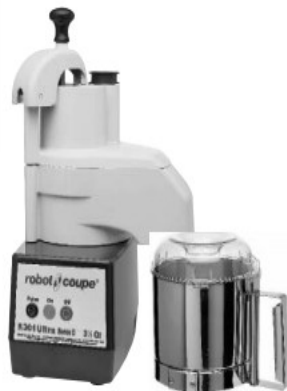
R301U Series D Model has Stainless Steel Bowl

Prepare 2000 restaurant servings in 3 hours. Healthcare facilities can prepare puree diets daily for 12 residents.